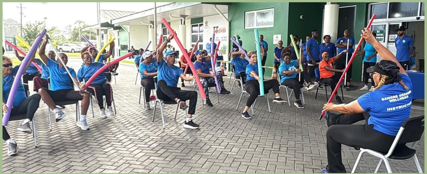
Veterans participate in fitness activity

The Sangre Grande Enhanced Health Centre came alive on November 15, 2025 as the Wellness Centre hosted its first Veterans Fitness Classic, a special event held in recognition of World Diabetes Day. The Fitness Classic was designed specifically for adults 60 years and older but attracted participants from age 51 . The event was also supported by members from the Matura and Manzanilla Wellness Centres and other nearby groups. This demonstrated a sense of unity, collaboration and shared commitment to community wellness.