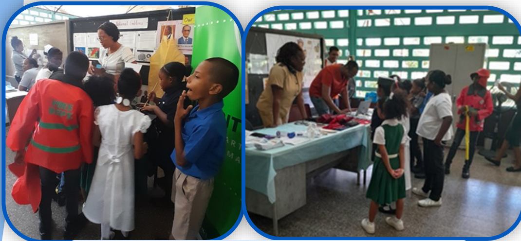
ERHA staff interacting with children at the career day at Cushe Government Primary School

What would you like to be when you grow up? This is a common question posed to primary school students.