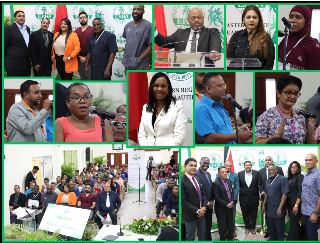
Photo Collage of Public Board Meeting

Transparency and public accountability were the guiding principles behind the Eastern Regional Health Authority's (ERHA) Public Board Meeting which was held on November 18, 2025, at the Morton Memorial Presbyterian Church, Guaico, Sangre Grande. The meeting was