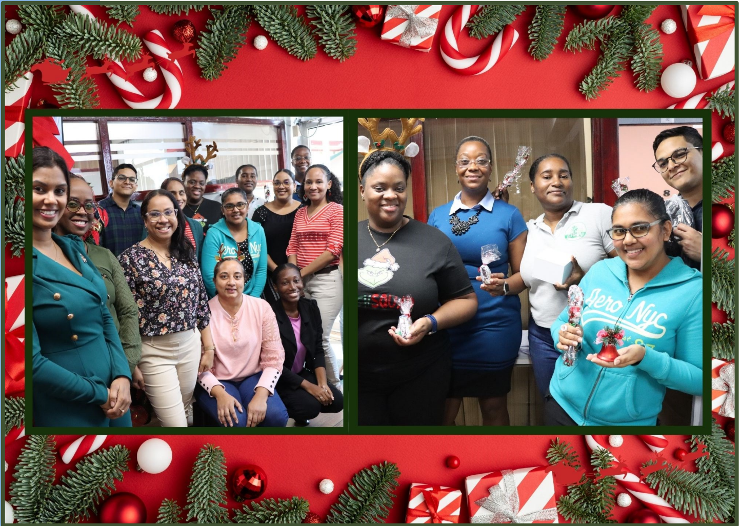
Staff at Supercare bring in the festive cheer

The Supercare Building came alive with festive cheer as staff gathered to usher in the Christmas spirit on November 28, 2025. The afternoon was filled with exciting activities which brought everyone together. Guided by the Office of the C.E.O, staff showed off their vocal talent during karaoke, spreading laughter and holiday melodies throughout the lobby. Creativity was on full display during the Christmas tree decorating, where teams added ornaments, ribbons and Christmas lights to adorn the tree.