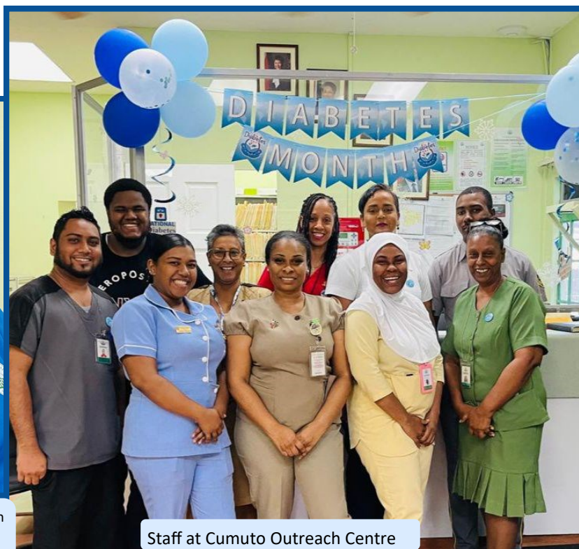
Staff at Cumuto Outreach Centre