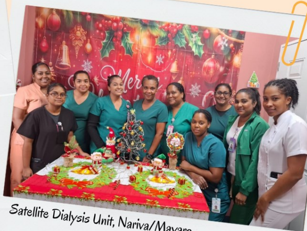
Satellite Dialysis Unit, Nariva/Mayaro