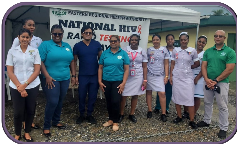
Staff at the Mini Health Fair

Regional HIV Testing Month is dedicated to raising awareness about HIV, its impact, the importance of testing, early diagnosis and treatment.