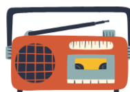
Battery Powered Radio