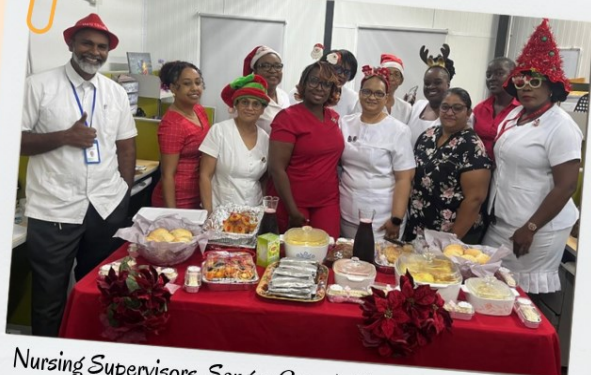
Nursing Supervisors, Sangre Grande Hospital Campus