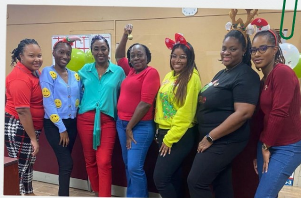
Communications Department- Head Office