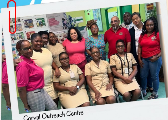
Coryal Outreach Centre