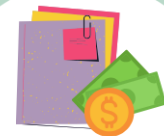
Important Documents & Cash