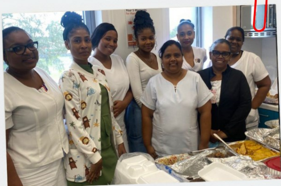
Surgical I- Sangre Grande Hospital Campus