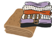
Clothing, Blankets & Towels