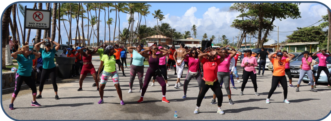
Aerobic Session at Manzanilla Beach Resort

Rags, flags and hands waved in the air as participants "chipped down d' road" during the energetic Walk for Wellness which was hosted by the Eastern Regional Health Authority's Manzanilla Wellness Committee on July 19, 2025 to re-launch the Manzanilla Wellness Exercise Classes. The event united community members, health enthusiasts and ERHA staff in one powerful stride towards healthier living.