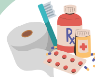
Hygiene Items & Medications