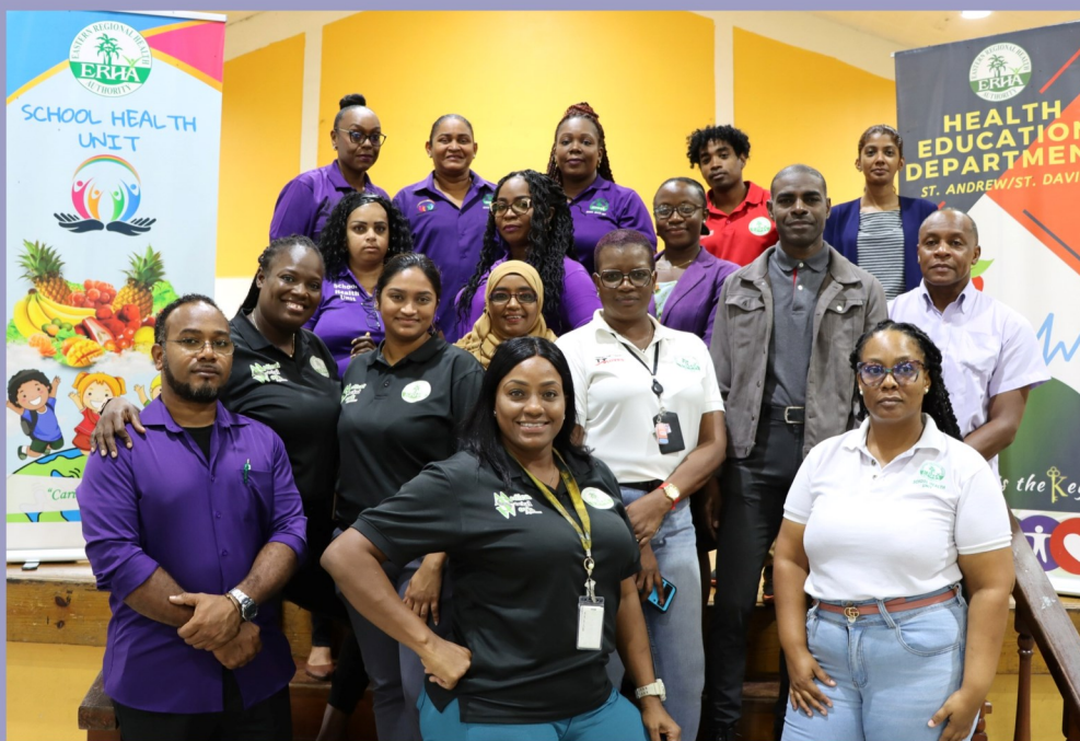
Eastern Regional Health Authority Staff Members at the Guaico Secondary School

Adolescence can be a challenging time for some children as they experience changes to their bodies and brains. Recognising the need to prepare children for the changes they may face