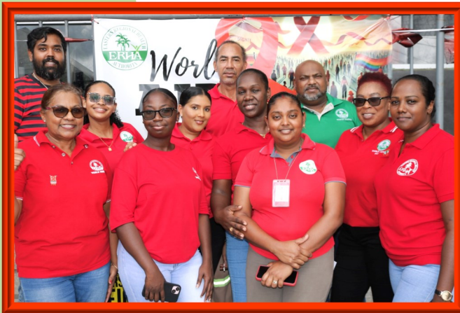
Staff from the Valencia Outreach Centre