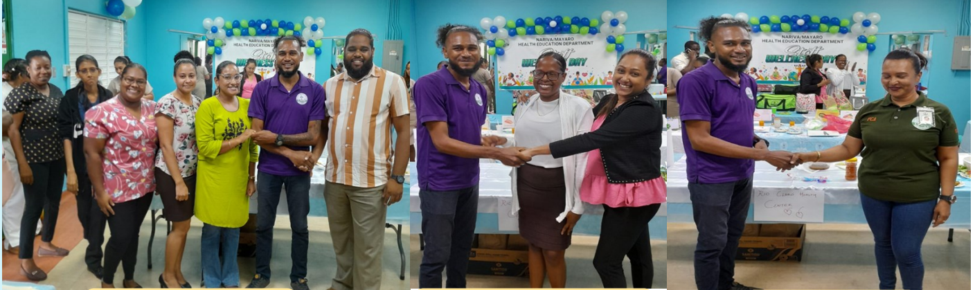
1st Place Winners Pharmacy Department