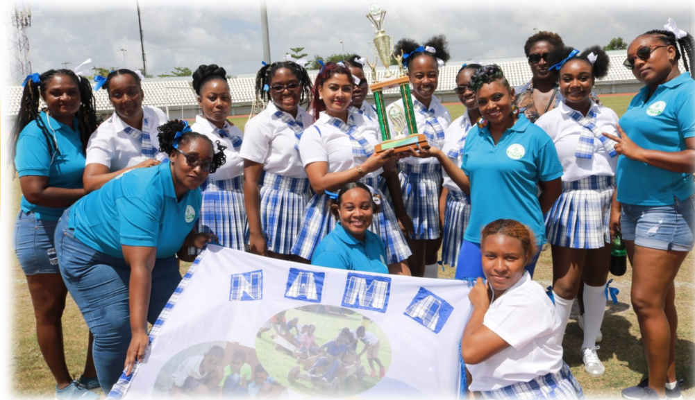
1st place winners of the March/Dance Past, Nariva/Mayaro pose with their trophy

Parents had fun introducing their children to traditional games on the programme such as hop scotch, ring toss, ludo, moral, marbles as well as novelty games.