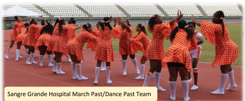
Sangre Grande Hospital March Past/Dance Past Team