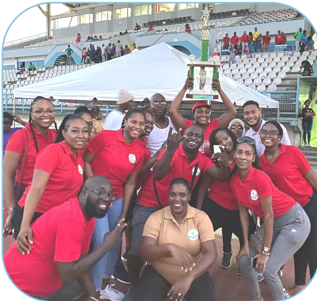
Overall winners of the Sports and Family Day St. Andrew/St. David