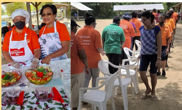
Members of the Chronic Disease Group display their chow and play musical chairs

Over 165 persons attended the Chronic Disease Support Group Network 12th Annual Fun and Family Day on May 11, 2023 at Trini River Lime, Matura.