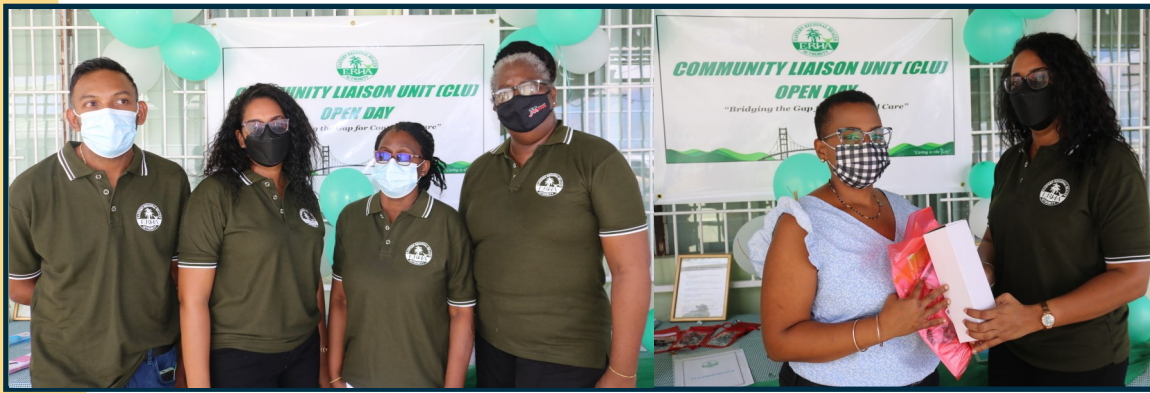
CLU staff at the Open Day