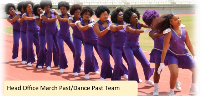
Head Office March Past/Dance Past Team