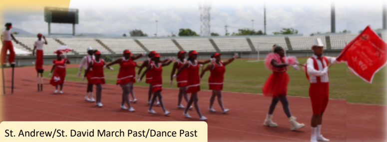
St. Andrew/St. David March Past/Dance Past