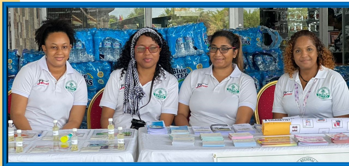
Health Education Department Team