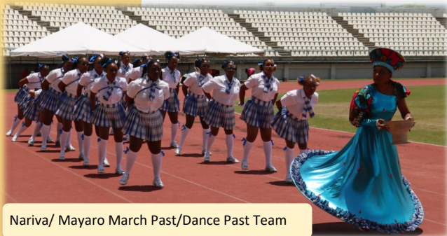
Nariva/ Mayaro March Past/Dance Past Team