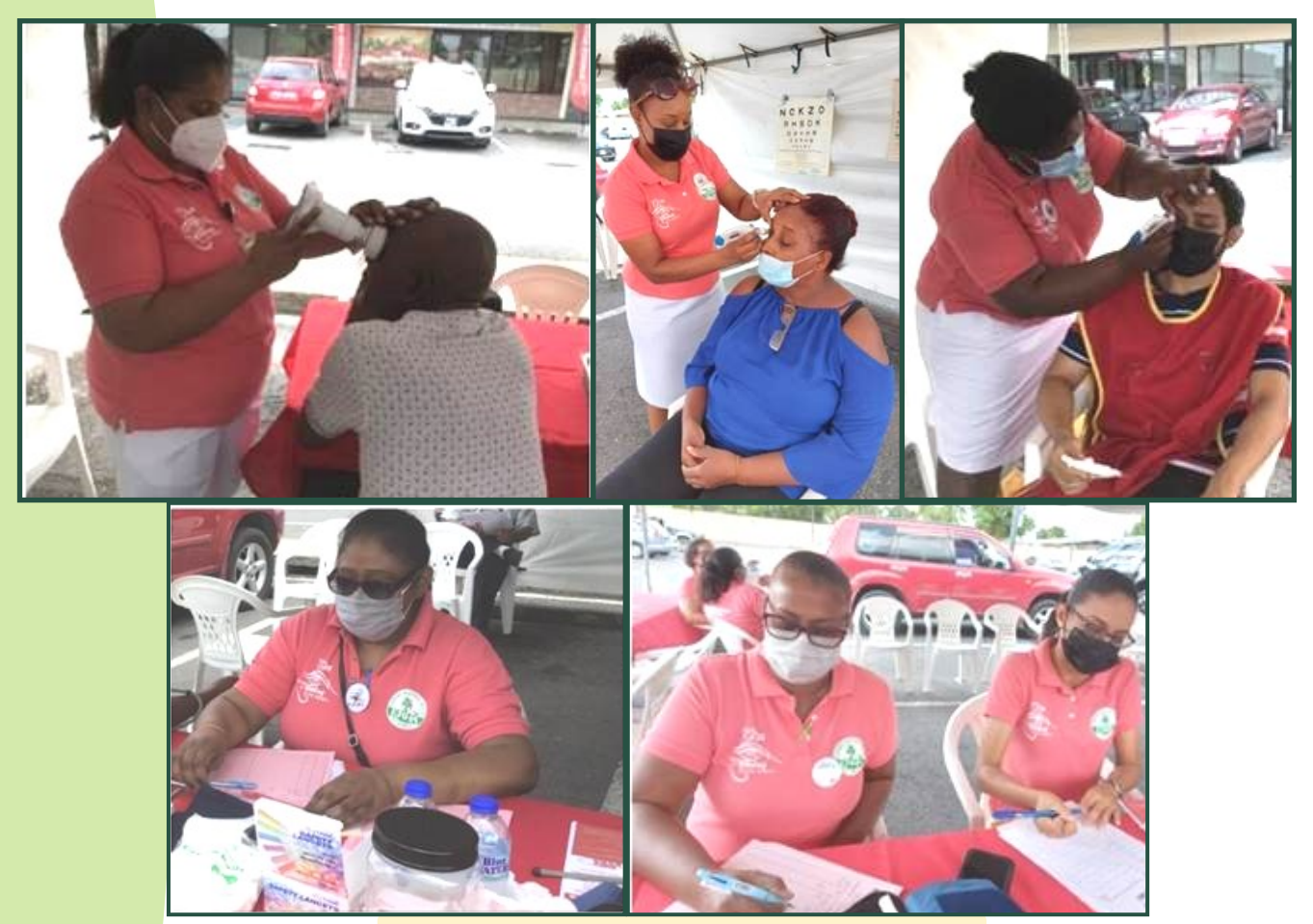
Staff do vision screening for clients at an Outreach at Xtra Foods Plaza

The Opthalmology Department is the next winner of the Dynamic Ward Initiative in the Sangre Grande Hospital.