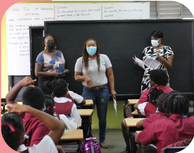
Students ask questions at the Medical Social Work session

Over 145 students in standards 4 and 5 in the St. Francis R.C School participated in an Emotional Intelligence session on June 8, 2022.