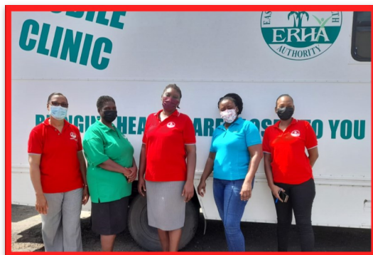
Members of staff pose by the Clinomobile at Paray's Car Park #2 Guayaguayare Road, Mayaro