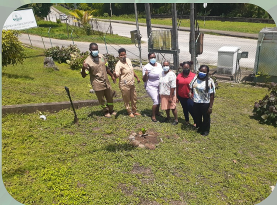
Staff at Matura Outreach Facility plant a fruit tree on the grounds of the facility