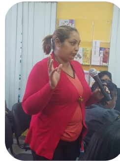
Community member gives a suggestion at the Cumana Outreach Centre Community Consultation