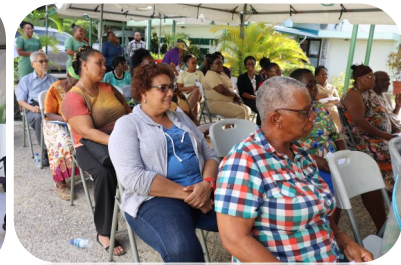
Community members at the Toco Health Centre's Community Consultation