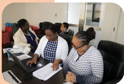
Members of the Technical Team at session