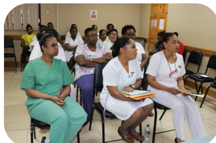
Nursing professionals at the launch