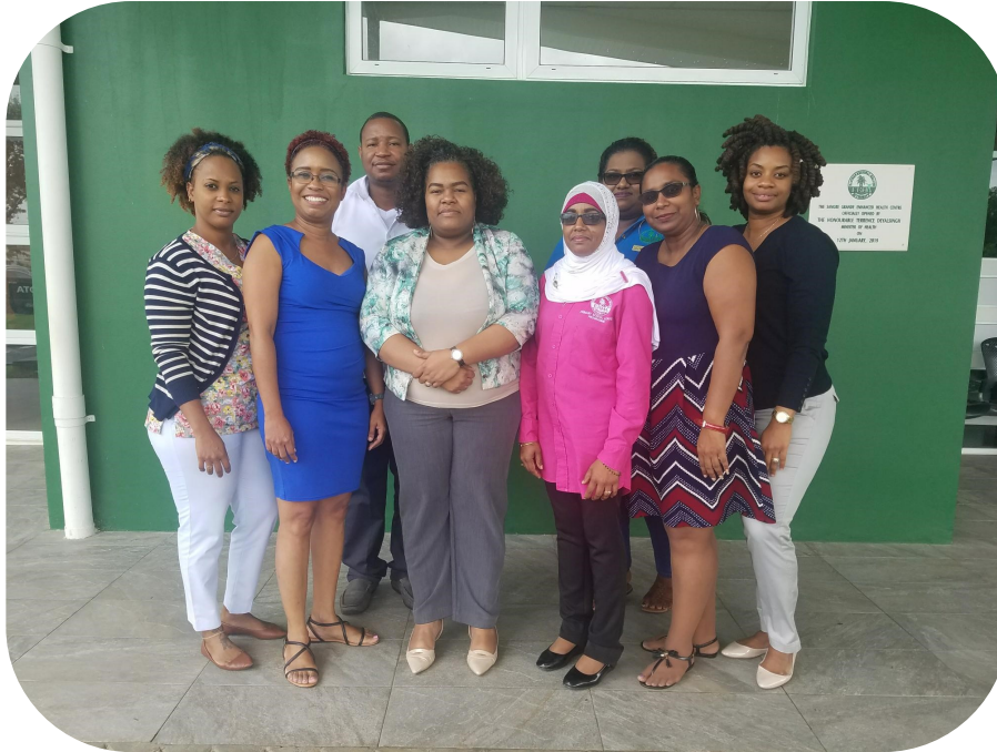
Members of the Sports and Cultural Club pose for a group photo at the Sangre Grande Enhanced health Centre