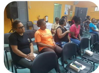
Residents at the Biche Outreach Centre Community Consultation