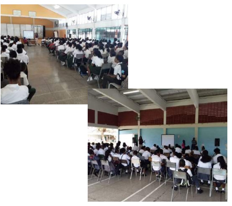
Lecture sessions at secondary schools

The sessions were conducted in collaboration with Medical Social Work Department, County St. Andrew/St. David.