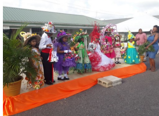
Children in their Easter attire at the parade

Friends of the Sangre Grande Hospital hosted their annual Easter Parade and Tea Party at the Sangre Grande Hospital on April 02, 2018.