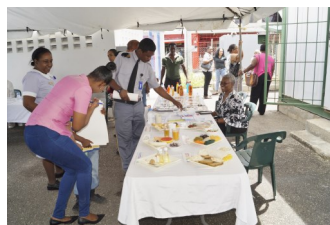
Persons visit a Nutrition display at the Mini Fair