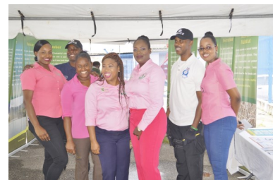
Staff members pose for a photo with Officers from the Trinidad and Tobago Police Service