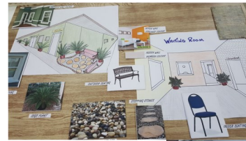
"Brighten Your Corner" initiative which is aimed at enhancing the Patient Waiting Area and outside of the Medical Laboratory Department

The Sangre Grande Hospital's Medical Laboratory Department wishes to thank the management and staff of the hospital for their continued support and looks forward to next year's celebrations.