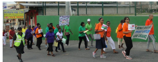
Health Walk to the Sangre Grande Recreation Ground

Fun activities followed, such as musical chairs, duck walk and armchair aerobics. Tips for healthy eating were given by members of the Nutrition Department and persons were also educated on maintaining a healthy Body Mass Index. See highlights below.