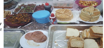
Breakfast for staff at the Medical Laboratory Department