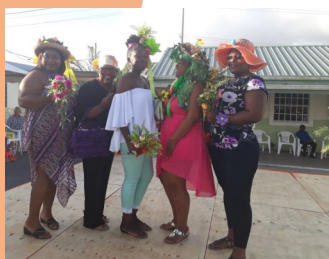
Ladies pose for a photo in their Easter Hats