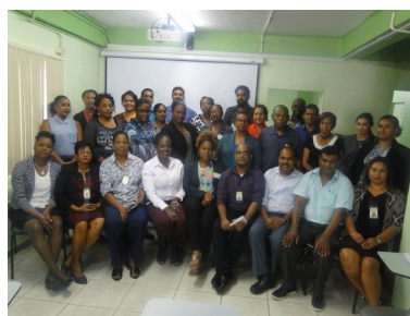
Facilitators and participants at an mhGAP training session held in February, 2018 at Sankar Building I

The six-month training programme which is coordinated by the Organizational and Employee Development (O&ED) Department began in February 2018 and continues with one session per month.