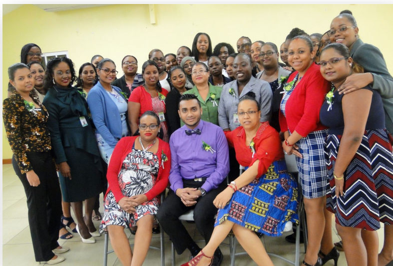
Administrative staff celebrates Administrative Professionals Week 2018 at the North Eastern Community Centre, Duranta Gardens