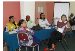
Members of staff at the Train the Trainer Programme