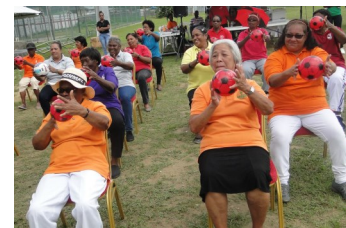
Members of the Chronic Disease Support Group Network enjoy Armchair Aerobics