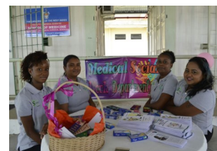
Members of the Sangre Grande Hospital's Medical Social Work Team at their celebrations

Additionally, tea and light refreshments were provided to the patients of the Oncology Department as part of the celebrations.