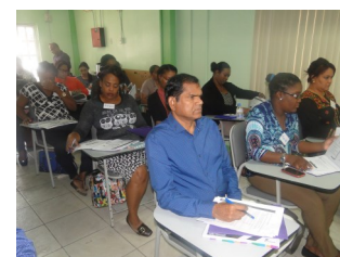
Participants in the first session of the mhGAP training programme