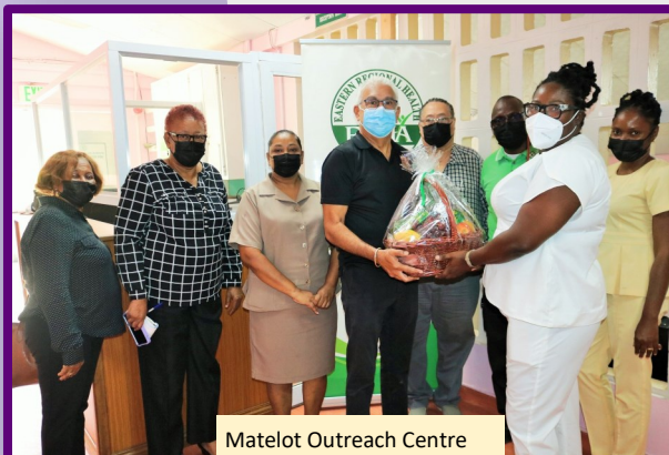
Matelot Outreach Centre