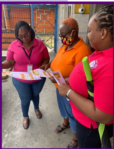
Members of the Baby Friendly Hospital Initiative Unit interact with a member of the public

Breast milk is a special type of nutrition for infants because of its healthy properties required for the infant's health, growth, and development.