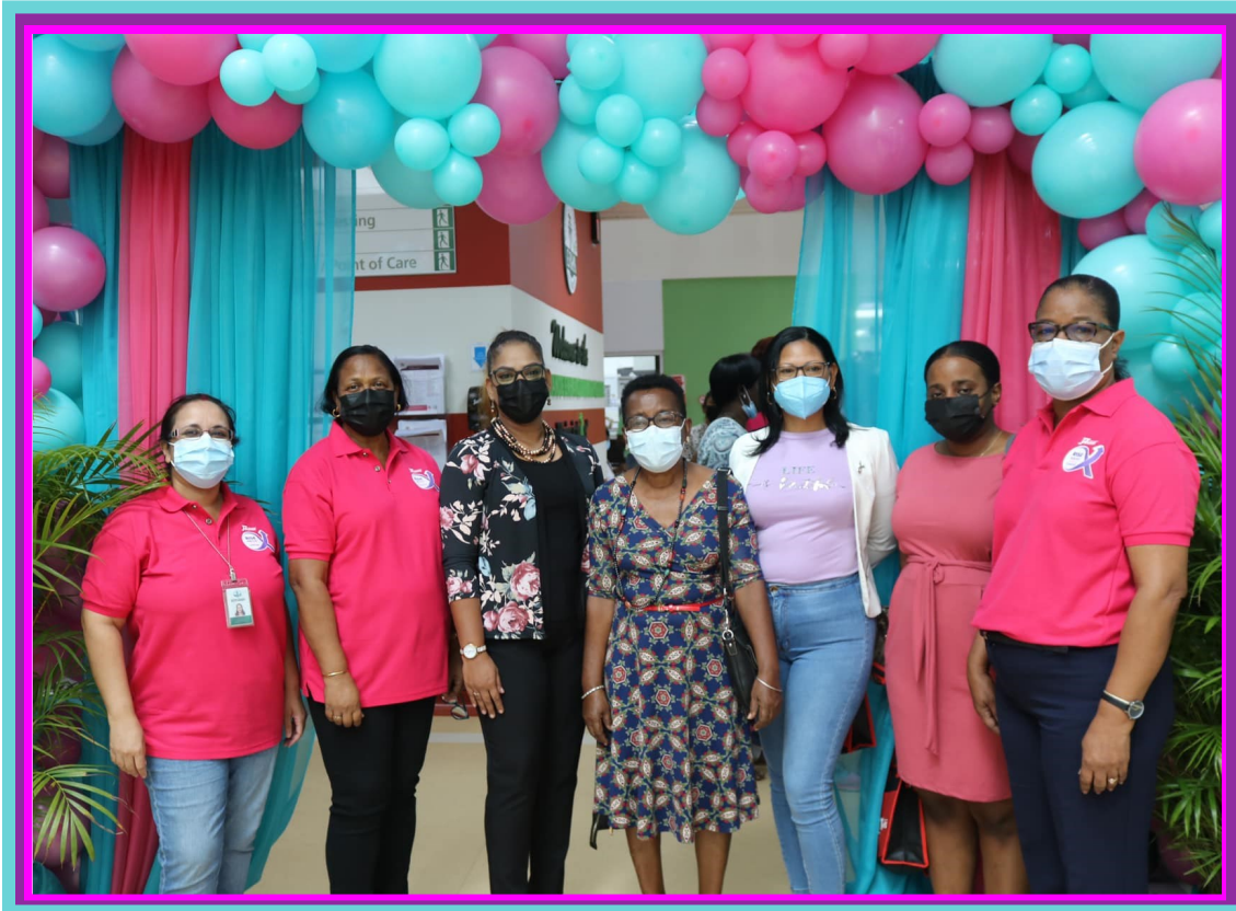
Members of the Board of Directors of the ERHA, special invited guests and members of staff of the ERHA

Over 500 women throughout the Eastern region responded to the call and choose to focus on themselves in the, "I CHOOSE ME: GREATER ACCESS, BETTER HEALTH FOR ALL WOMEN" Campaign.