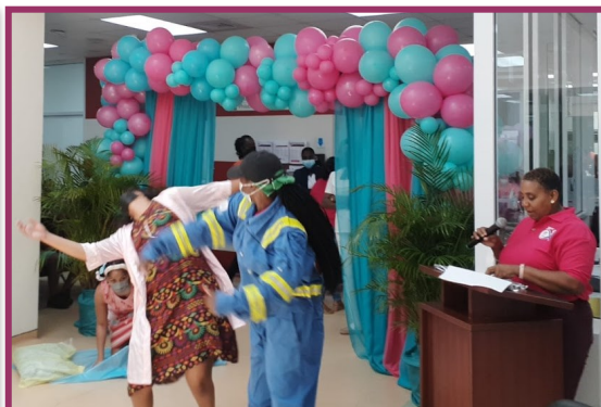
Intimate Partner Violence Skit