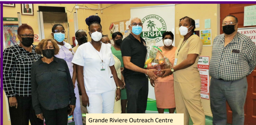
Grande Riviere Outreach Centre

The Honourable Terrence Deyalsingh, Minister of Health continued his series of visits to Primary Care Health facilities in the Eastern Regional Health Authority (ERHA) reaching out to the staff in Toco, Matelot, Grande Riviere and Sans Souci. The Minister was overjoyed and commended them for their commitment and dedication to provide quality healthcare to the people of Trinidad and Tobago.