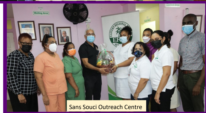
Sans Souci Outreach Centre

The clinical staff gave feedback to the Minister on good results that were experienced at health office clinics and in particular at Chronic Disease Clinics. They noted that through education drives