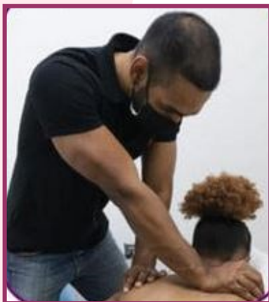
Staff receives rejuvenation therapy

The staff of the Mayaro District Health Facility also performed a skit with a strong message on Intimate Partner Violence to the captive audience at the Sangre Grande Enhanced Health Centre.