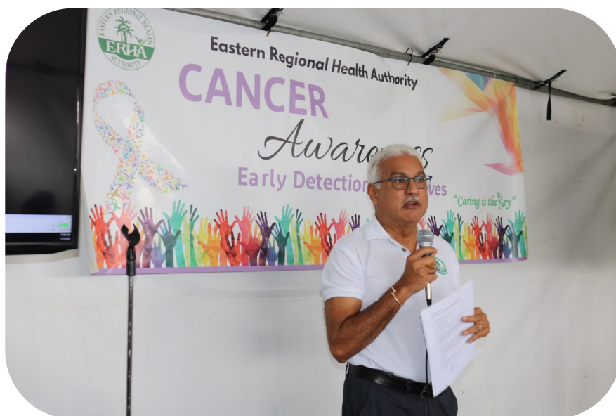
The Honourable Terrence Deyalsingh, Minister of Health encourages members of the public to get screened for cancer

"Early Detection Saves Lives" was the main message emphasized by the Honourable Terrence Deyalsingh, Minister of Health as he encouraged members of the public to get screened for cancer at the Eastern Regional Health Authority (ERHA) Breast Cancer Awareness Drive.