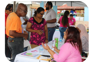
Clients visit the Medical Social Work Department display area at the Breast Cancer Awareness Drive in Rio Claro