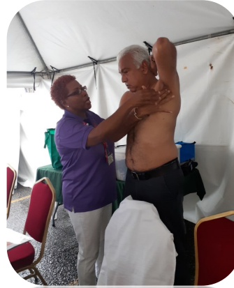
The Honourable Terrence Deyalsingh, Minister of Health is guided by Nurse Suzette Fernandez to perform a Breast Self-Examination

Over 200 residents of Rio Claro accessed the various services provided such as Breast Examinations, Cancer Screening, Flu Vaccines, Consultations, Blood Sugar Testing and Blood Pressure Testing amongst others.