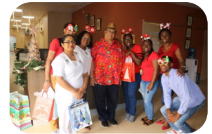
Carolers and CEO pose for a photo at CT Department, SGH