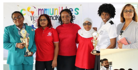
Northeastern College proudly displays their 1st place award and People’s Choice award