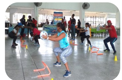
Participants engage in cross fit training