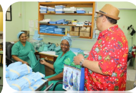
CEO presents gift bag to staff at CSSD, SGH