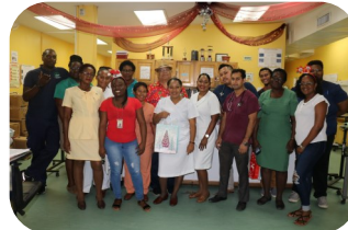
Staff of A&E, SGH with CEO and carollers