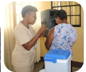
Client gets flu shot