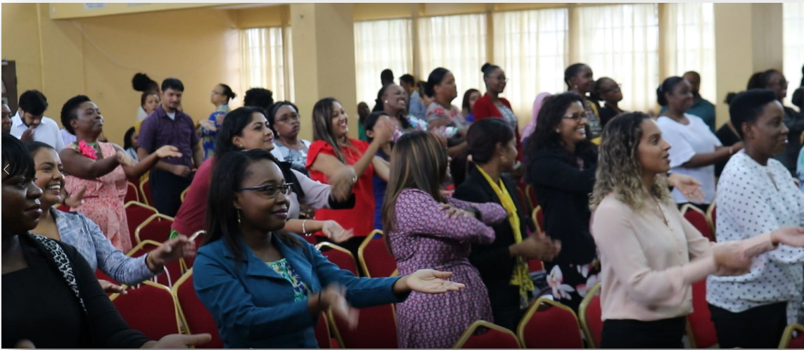
Members of staff engage in workout at the Annual General Meeting