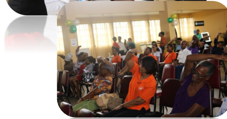
Audience participates in a physical activity session