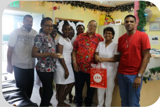
CEO with staff at Mayaro District Health Facility

Clients at the health facilities also joined in on the fun and sang along with the carolers as they too were touched by the visit.