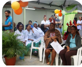
Members of staff enjoy the entertainment