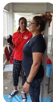
Resident of Rio Claro checks her height

The importance of water and fruit consumption were also highlighted in the educational presentation and wellness booths which offered blood pressure testing, blood sugar testing, Body Mass Index, massage therapy and flu vaccinations.