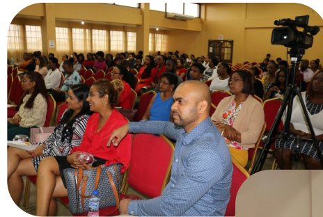
Members of staff at the Annual General Meeting