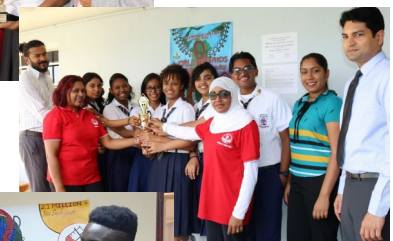
Students and Staff of the SWAHA Hindu College show off their 2nd place prize