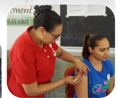
Client receives a flu vaccine