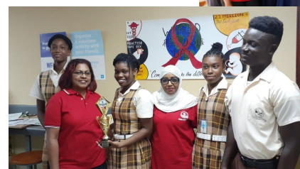
Students of the Toco Secondary School pose with representatives from the ERHA and their 3rd place trophy