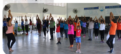
Persons participate in an aerobic burnout