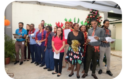
Para-Clinical staff brings smiles to all with their Christmas medley