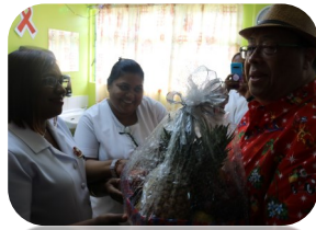
Staff of Rio Claro Health Centre presents CEO with fruit basket