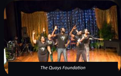
The Quays Foundation