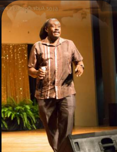
Member of the Sombroso Group performs