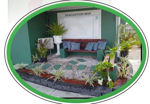
Sangre Grande Hospital (Medical Laboratory) – Waiting Room and Exterior Upgrade