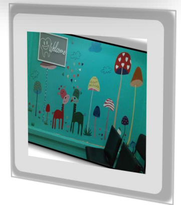
Rio Claro Dental Unit – Read with me Corner