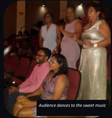
Audience dances to the sweet music