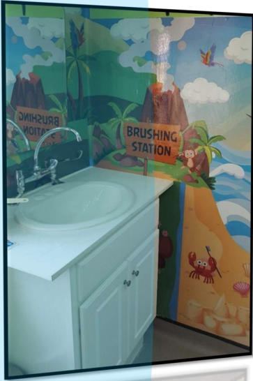
Cumuto Dental Department - Child Friendly Dental Care

Take a look at some of the projects below.