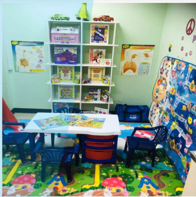
Medical Social Work Department – Play Therapy Corner