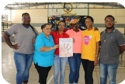
Members of the Nutrition Department

Schools in attendance at the camp were Toco Secondary School, Northeastern College, Manzanilla Secondary School, Sangre Grande Secondary School, Guaico Secondary School and Tuition and Success.