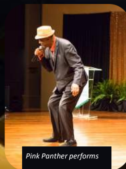
Pink Panther performs