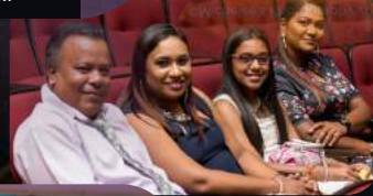
Audience at the night of Elegance