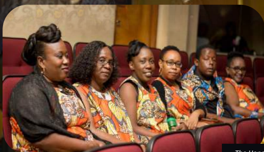
Audience at the night of Elegance