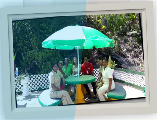
Guayaguayare Outreach Centre – Sitting Out Facilities