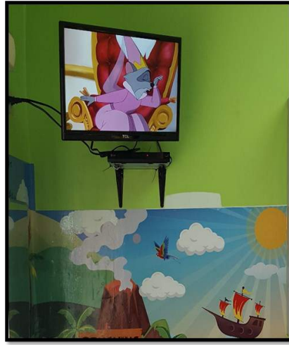
Cumuto Dental Department - Child Friendly Dental Care