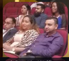
Audience at the night of Elegance