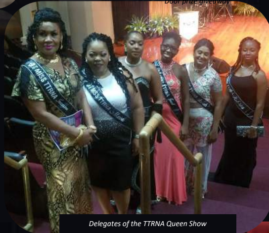
Delegates of the TTRNA Queen Show