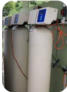
Water Harvesting System Increasing the quality and supply of potable water to ensure a sustainable supply post natural disasters.