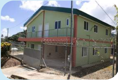
New Quarters for clinical staff to have quick and easy access to respond to emergencies

The Team also responded to questions and demonstrated the new technology installed at the health facilities. Clients who were present interacted with Minister Deyalsingh who listened to their view points with an aim to improving the health care services to ensure a "Healthy you, Healthy me, Healthy T&T."