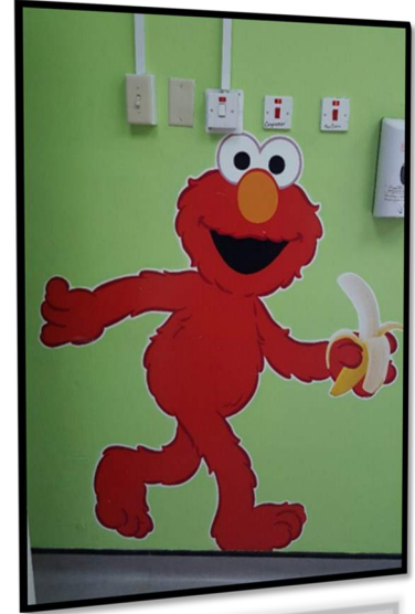
Cumuto Dental Department - Child Friendly Dental Care