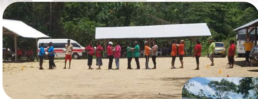
Participants engage in ball walk