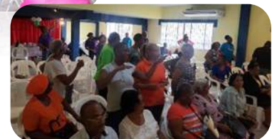
Attendees participate in a physical activity session