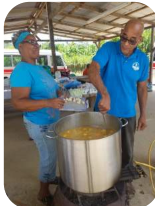
Group members prepare a healthy corn soup