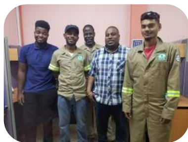
Some of the male staff at Libert Building