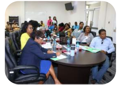
Representatives of various institutions at the symposium