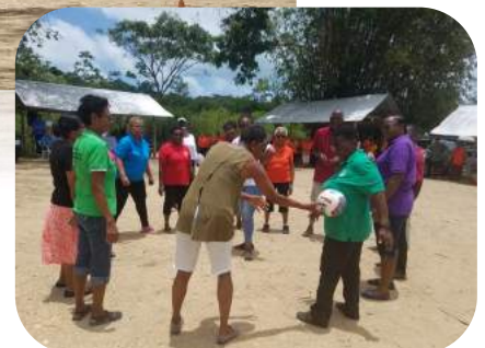
Pass the Ball fun