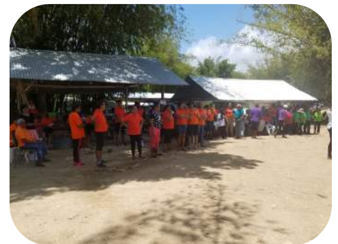
Persons enjoy the fun activities