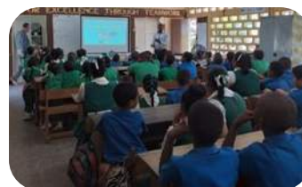
Students of the Cushe Government Primary School listen attentively to the safety alert lecture