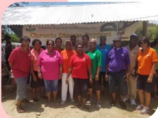
Presidents and members of the Chronic Disease Support Group Network pose for a group photo