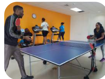
Clients and staff engage in physical activity at the Sangre Grande Enhanced Health Centre's Wellness Room

practical interventions aimed at preventing cardiovascular disease in primary health care by ensuring equitable access to continuous, standardized, high-quality care for people at high risk.