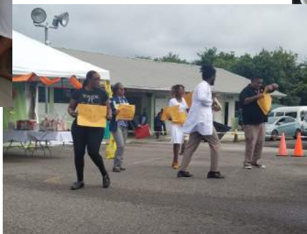
Team Sangre Grande Enhanced Health Centre performs in the Ole Mas Competition