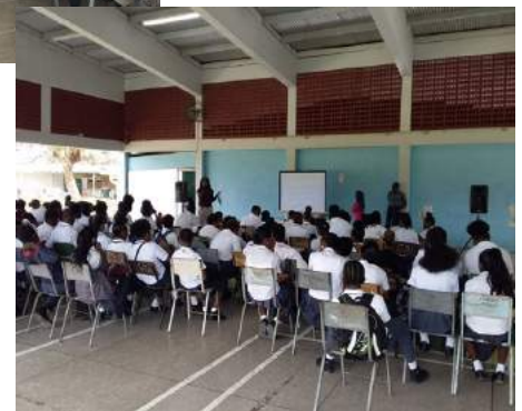
Lecture sessions at secondary schools