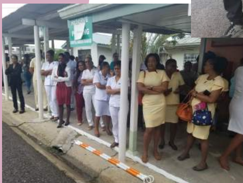
Staff members view the entertainment from the corridors