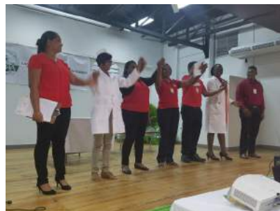
NAMA takes a bow after their presentation