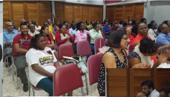
Audience enjoys the presentations