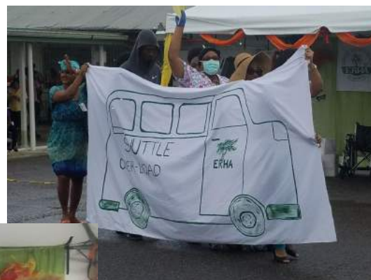
North Coast Crew presents "A Day at the North Coast"