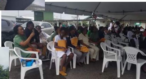
Audience enjoys the performances