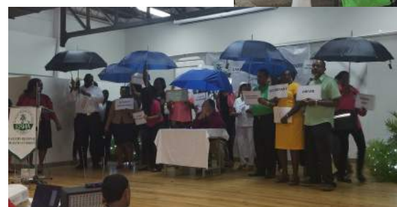
Head Office with umbrellas in their portrayal