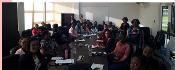
Participants of the two-day training session

The activities were coordinated by the Prevention of Mother to Child Transmission of HIV (PMTCT) Unit of the ERHA.