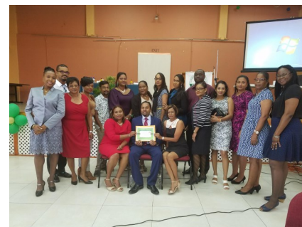
Staff of Nariva/Mayaro poses for a photo at their Annual Review