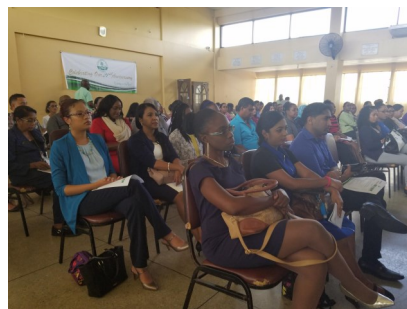
Staff members at the Head Office Annual Review