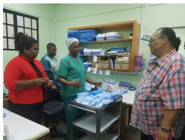
CSSD Department welcomes CEO