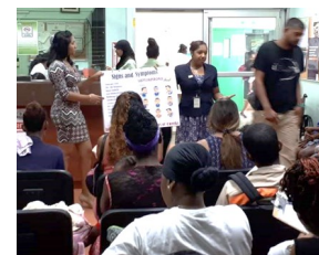
Members of the Health Education Department conduct a presentation