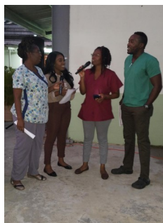
Medical staff sings Christmas Carols

Clients and staff enjoyed the open air concerts and were seen dancing and singing along to their favourite selections. Visitors captured the show on their mobile devices and transmitted live to their loved ones who were admitted to the wards.