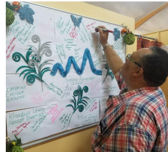
CEO signs notice board at Ward 3