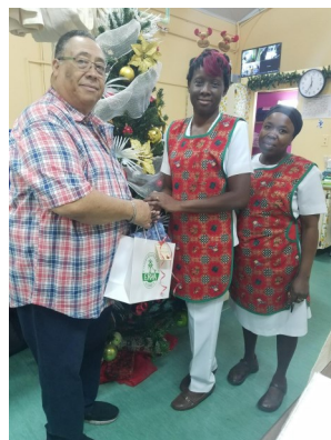
CEO with nurses at Pediatrics