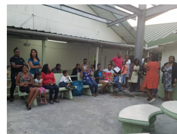
Staff and clients enjoy the entertainment