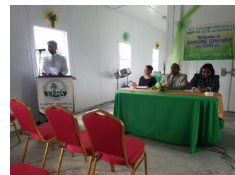
Head Table at the SGH's Annual Review