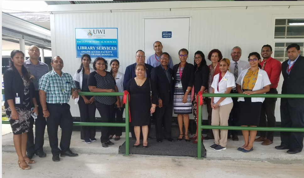
Group photo of ERHA and UWI professionals at the On-Line Library Facility

Medical students are now equipped with the necessary tools to access research material as the Eastern Regional Health Authority (ERHA) introduces an On-Line Library Facility at the Sangre Grande Hospital in collaboration with the University of the West Indies (UWI). See more on page 2.