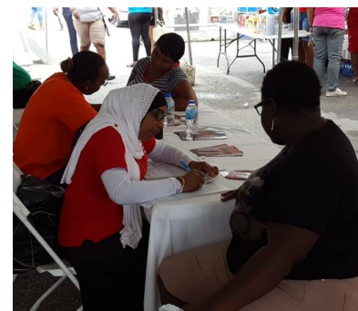
HIV Rapid Testing session in Sangre Grande